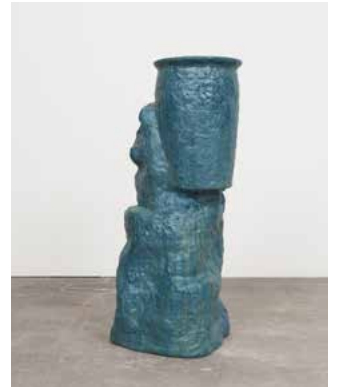
Object for a Plant (Petitot's Dream #15) , 2024 Glazed ceramic 40 x 22 x 17 inches (101.6 x 55.9 x 43.2 cm)