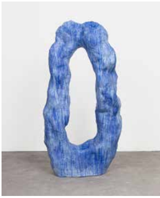
Object for a plant , 2024 Glazed ceramic 72½ x 41 x 22 inches (184.2 x 104.1 x 55.9 cm)