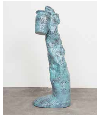
Footed Vessel for a Plant , 2024 Glazed ceramic 73 x 35 x 31 inches (185.4 x 88.9 x 78.7 cm)