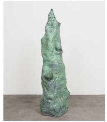
Object for 6 plants , 2024 Glazed ceramic 70 x 23 x 17 inches (177.8 x 58.4 x 43.2 cm)