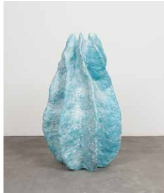
Object for a Plant (Pod) , 2024 Glazed ceramic 53 x 34 x 32 inches (134.6 x 86.4 x 81.3 cm)