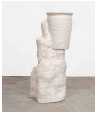
Object for a plant (Petitot's Dream #14) , 2024 Glazed ceramic 43 x 23 x 20 inches (109.2 x 58.4 x 50.8 cm)