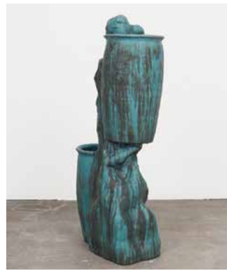
Object for two plants (Petitot's Dream #13) , 2024 Glazed ceramic 58 x 32 x 18 inches (147.3 x 81.3 x 45.7 cm)